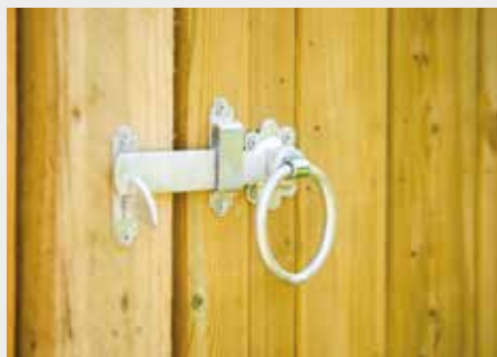
Gates & Gate Hardware