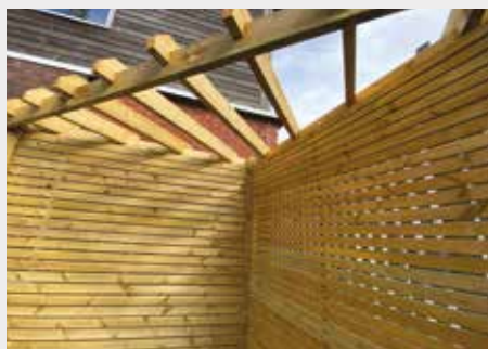
Treated & Untreated PAR