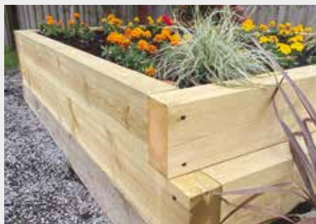
Softwood & Oak Sleepers