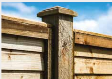
Fence & Gate Posts, Gravel Boards, Post Mix