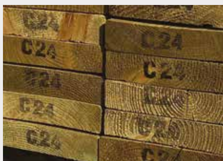
Graded & Ungraded Carcassing