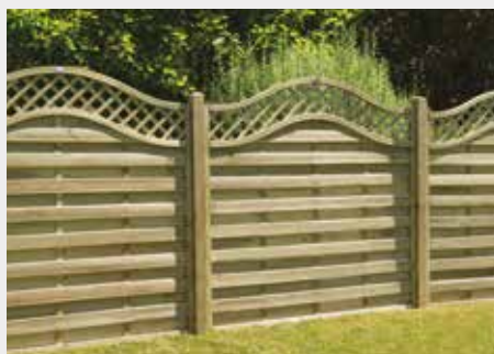
Traditional, Decorative and Acoustic Fence Panels