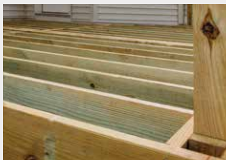
Decking Frame Timber