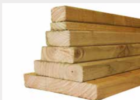
Treated & Untreated Sawn Timber in a range of sizes